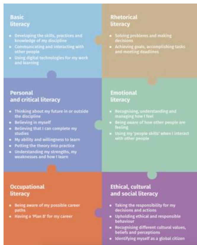
Figure 1: Student (plain English) version of the Literacies for Life (L4) model

The measure underpins a metacognitive model of employability in which employability is defined as “the ability to create and sustain meaningful work across the career lifespan” (Bennett, 2016). The model’s six inter-related Literacies for Life combine to enhance employability and inform personal and professional development. The student version, illustrated at Figure 1, was shared with students as part of their profile and workshop.